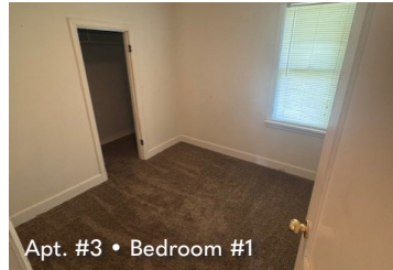
Apt. #3 • Bedroom #1