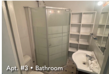
Apt. #3 • Bathroom