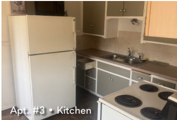
Apt. #3 • Kitchen