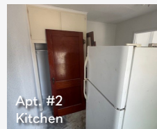
Apt. #2 Kitchen