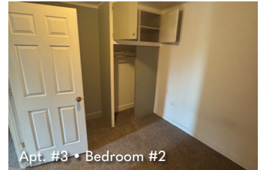
Apt. #3 • Bedroom #2