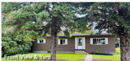
Front View & Yard

Sq. Feet: 1,920 Bedrooms: 3 Bathrooms: 2 Personal Property Included: Dishwashe, Fridge, Microwave, Washer & Dryer