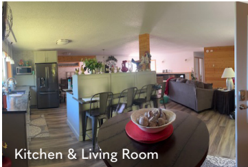
Kitchen & Living Room

Photos and videos just don't do this property justice! Located on the water of the Bisbee Dam, this fully updated house sits on 18+ acres of land and is unlike any property around. Boasting a 4 hole golf course, shop, barn, shed, grain bins, a grain bin converted into a fireplace, and countless other amenities. For the sportsmen, the hunting and fishing is also top-of-the-line with Walleye, Northern Pike, and Perch in the Bisbee Dam. Many Waterfowl, White-Tail Deer, Upland Game, and several other lakes are in the area! Come check it out!