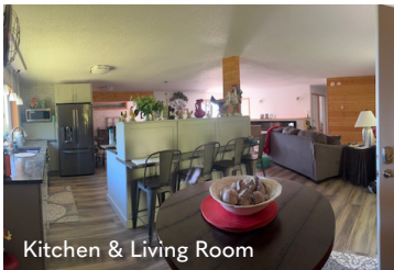
Kitchen & Living Room

Photos and videos just don't do this property justice! Located on the water of the Bisbee Dam, this fully updated house sits on 18+ acres of land and is unlike any property around. Boasting a 4 hole golf course, shop, barn, shed, grain bins, a grain bin converted into a fireplace, and countless other amenities. For the sportsmen, the hunting and fishing is also top-of-the-line with Walleye, Northern Pike, and Perch in the Bisbee Dam. Many Waterfowl, White-Tail Deer, Upland Game, and several other lakes are in the area! Come check it out!