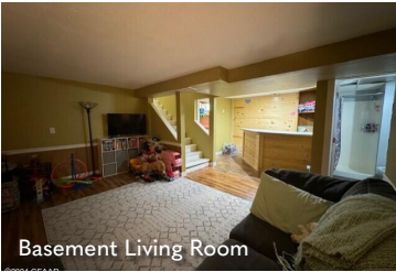
Basement Living Room