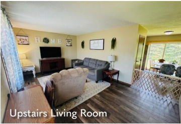
Upstairs Living Room